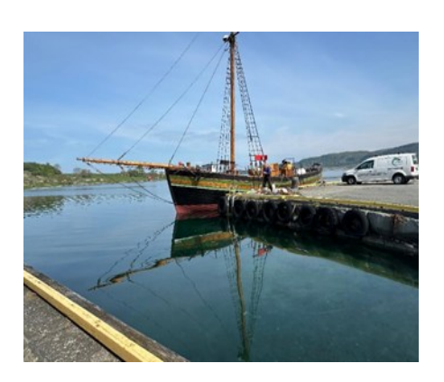
Cecil and Meri on tour of the Restauration