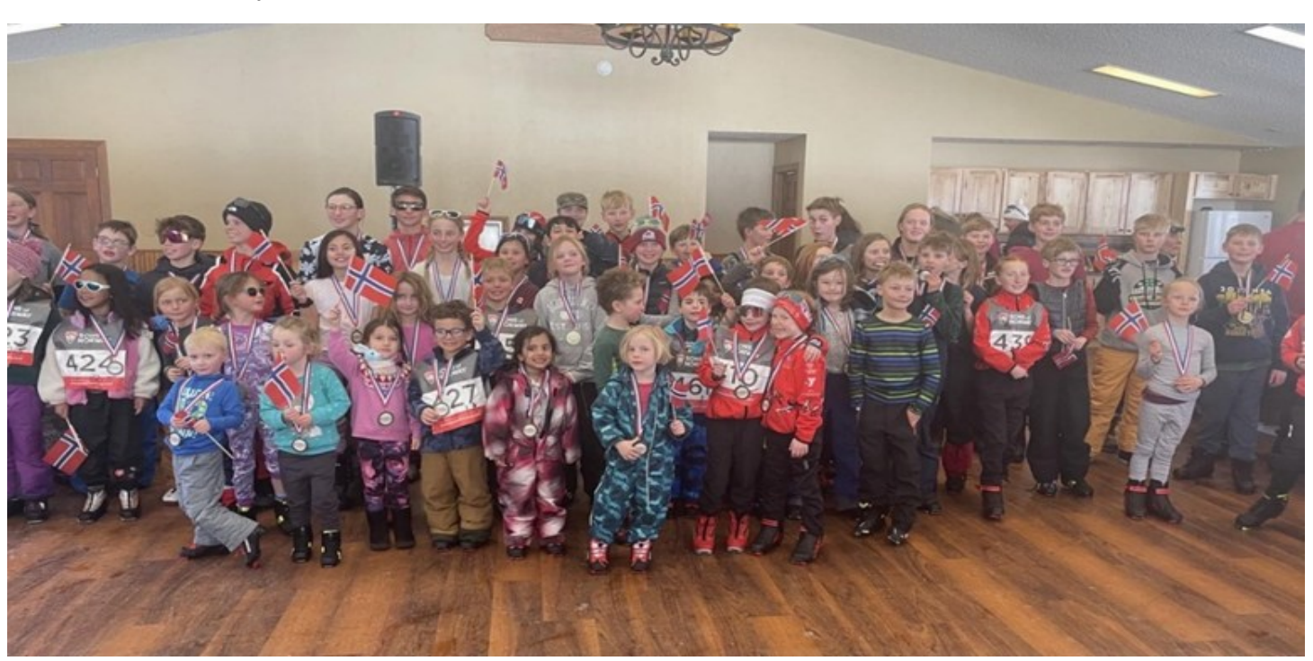
108 Children participated in District Six Barnelopet, a cross-country ski event for children in February 2025 in Colorado