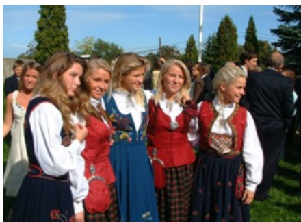
From Sons of Norway Newsletter Service

see the photos in Aftenposten in the pattern for the myriad ways to express one’s creativity in this modern take on a folk costume. Find examples of patterns here: https://faebrik.no/products/faestdrakt